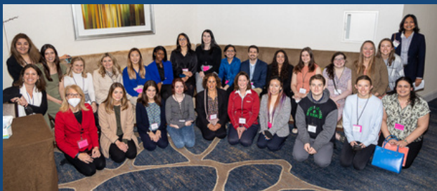
The Women's Center's Volunteers at The Leadership Conference

In 2022, 46 volunteers contributed 2,191 hours to The Women's Center. These dedicated volunteers played a vital role in our operations, whether it was handling daily Information & Referral calls, supporting our virtual education programs, or providing valuable administrative assistance. We also had 80 volunteers that helped with various events. With their skills, time, and compassion, our volunteers were instrumental in keeping us moving forward.